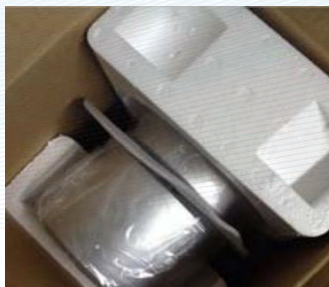
Aluminum Foil Roll