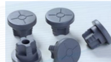
Rubber Frozen Dry Series