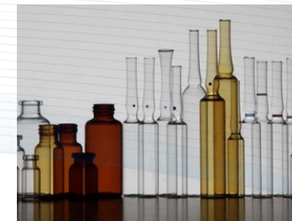
Glass Vial and Ampoule